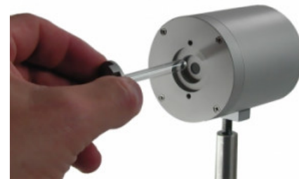
Integrating Sphere UPK-30S60-TT

Integrating sphere models UPK-30S60-L feature a unique stretched design specially made for the measurement of side emitting fibers up to 40mm long. Elongation of the ODM98 coated sphere from 30mm diameter to a length of 60mm eliminates the need for a large diameter sphere. Its unique collar baffle design avoids direct illumination of the detector by the side emitting fiber. The detector port provides an interface for direct mounting of Gigahertz-Optik's PD-11, TD-11 and VL-11 type light detectors and UFC-11 type fiber light guide connectors. The recommended useful wavelength range of the stretched integrating sphere is from 250 nm to 2500 nm. Gigahertz-Optik's calibration laboratory offers traceable spectral radiant power sensitivity calibration in the wavelength range from 250 nm to 1800 nm.