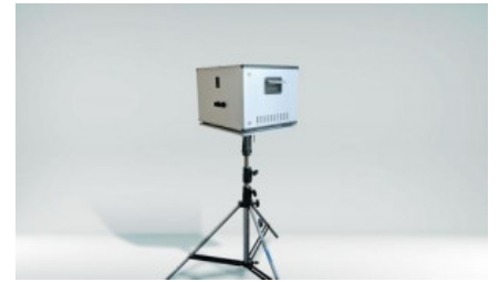
SST-18xx mounted on a tripod

Spectroradiometers enable the precise measurement of the wavelength-dependent irradiance with traceability to international standards. The