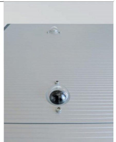
SST-18xx radiation input optics

Software is supplied for control, data acquisition and display of results via the Ethernet interface. A software development kit is optionally available for applications in which the measuring device is to be integrated with user written software.